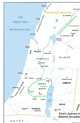
Province of Judah